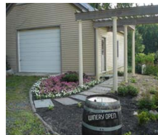
Spend Labor Day weekend at the winery sampling our newest releases!

Vin Blanc is our newest white wine blend. It contains both Chardonnay and Pinot Gris. It has exquisite hints of peaches, melons, and apples. With just a touch of oak and a long finish, this is a great way to end your summer, and begin the fall season.