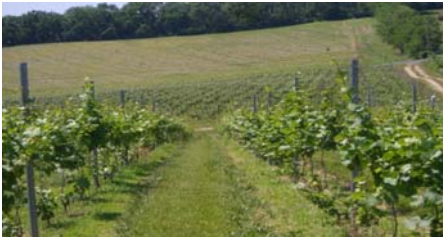
A view of our new Kutztown vineyard from the top of our sloping 35 acre farm.

Happy Summer to all! Even though the weather is taking its time to warm up, it is a nice opportunity to relax. Here at Blair Vineyards we will be working hard this summer building our new tasting room and winery! Raise your glasses to our new location in Kutztown on Dietrich Valley Road, right off of Interstate 78 and Route 737 just a few miles from Pinnacle Ridge Winery. We have already planted 16 acres of vines and an additional 14 acres will be planted over the next few years. The plans are to more than quadruple in size for a total acreage of 38 acres of vinifera.