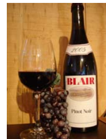
Use Blair Vineyards' 2005 Pinot Noir in the Risotto recipe to the right.

Remove the pan from heat and stir in the butter and Parmigiano-Reggiano until well mixed. Serve with additional Parmigiano-Reggiano if desired.